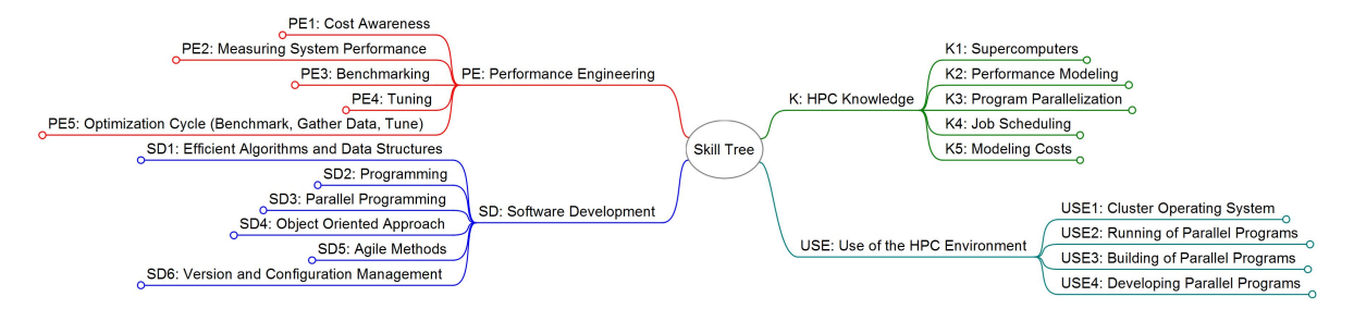
Fig. 1: Top Level Competences

We started our development of the HPC Certification Program with the classification of HPC topics which were relevant to the three compute centers (DKRZ, RRZ, and TUHH RZ) involved. We initially identified four top level competences: "HPC Knowledge", "Use of the HPC Environment", "Performance Engineering", and "Software Engineering for HPC" as shown in Figure 1.